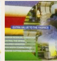
Fabrics quality controller