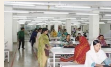
Trimming & mending section