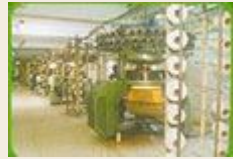
Yarn input in circular knitting machine