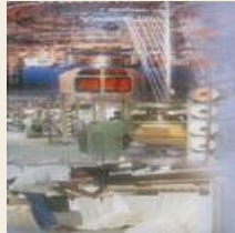
Grey Fabrics output from circular knit machine