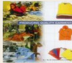
Sewing process is going